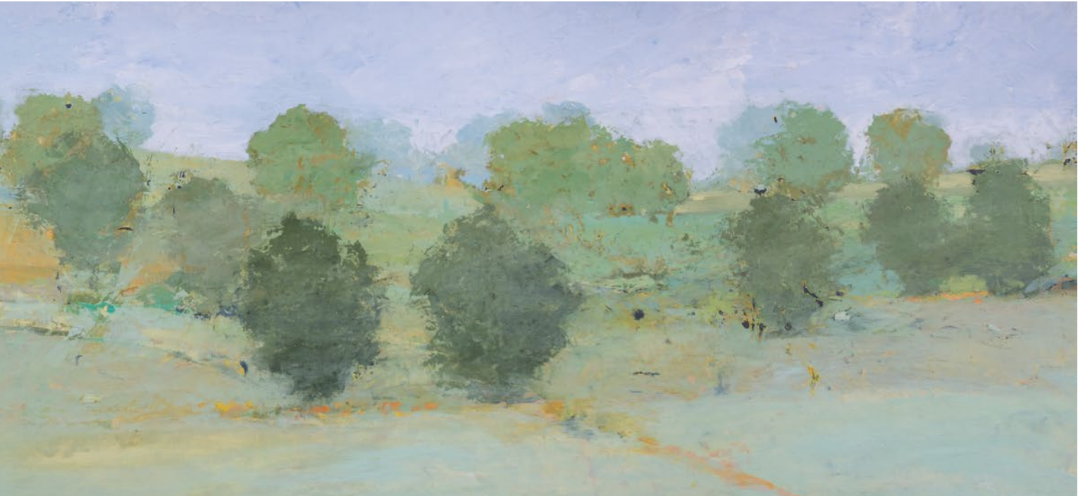
MISTY AFTERNOON 94 x 239 cm oil on canvas