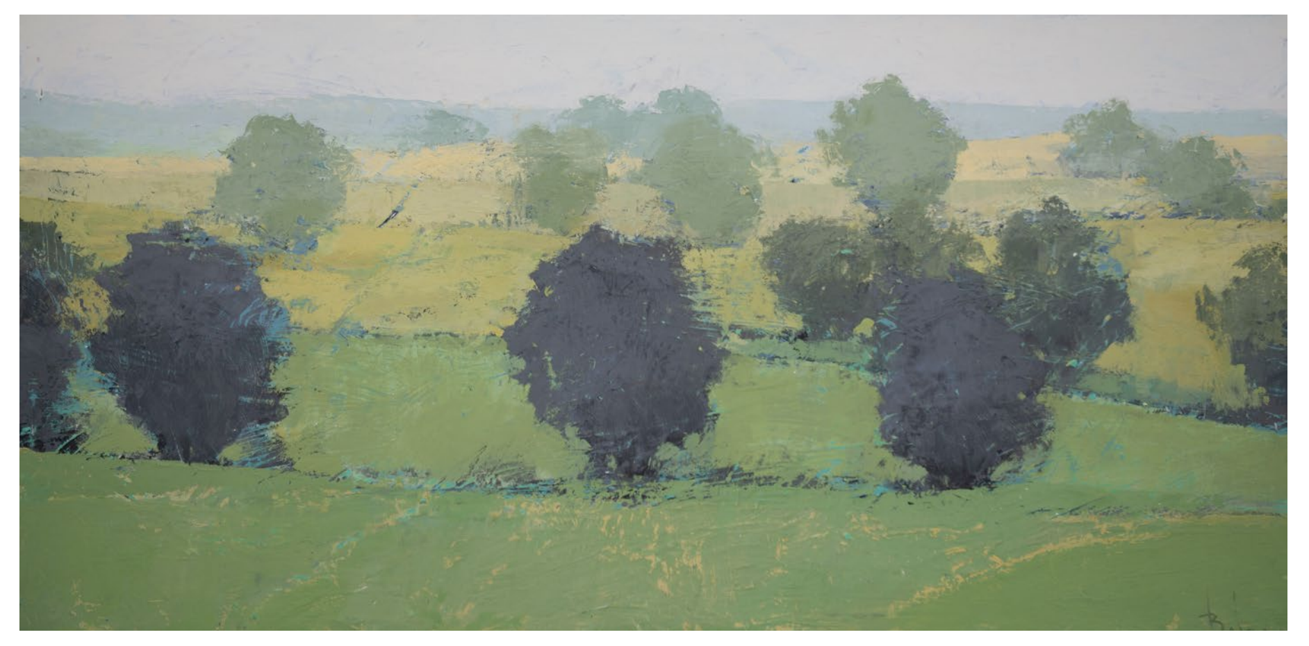
FIELDS OF GREEN 76 x 153 cm mixed media on panel

PASSING COUNTRYSIDE 102 x 102 cm oil on canvas