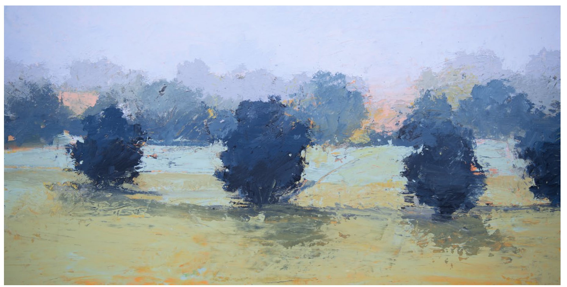
SUNSET 61 x 120 cm oil on canvas