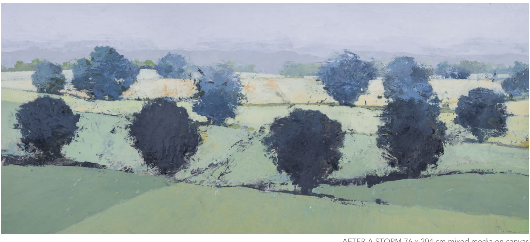
AFTER A STORM 76 x 204 cm mixed media on canvas