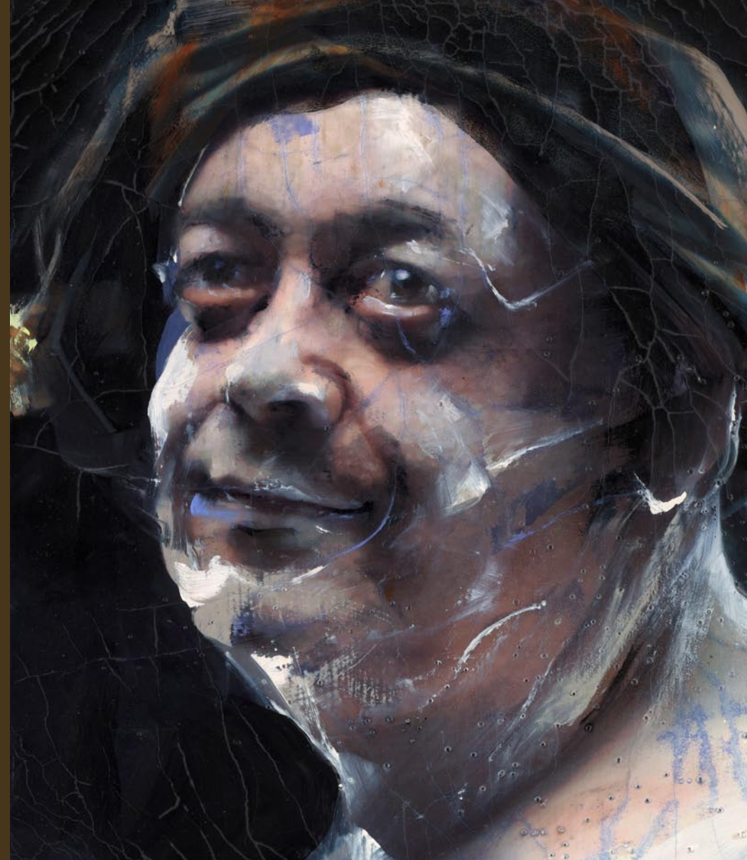
SANCHO PANZA V, 2010 Mixed Media - 75 x 65 cm