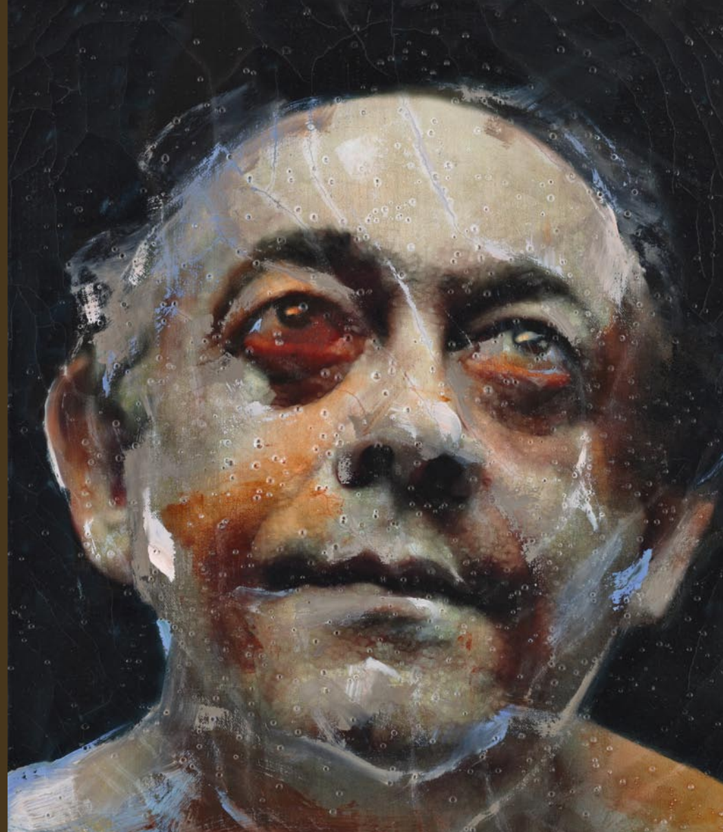
SANCHO PANZA I, 2010 Mixed Media - 75 x 65 cm