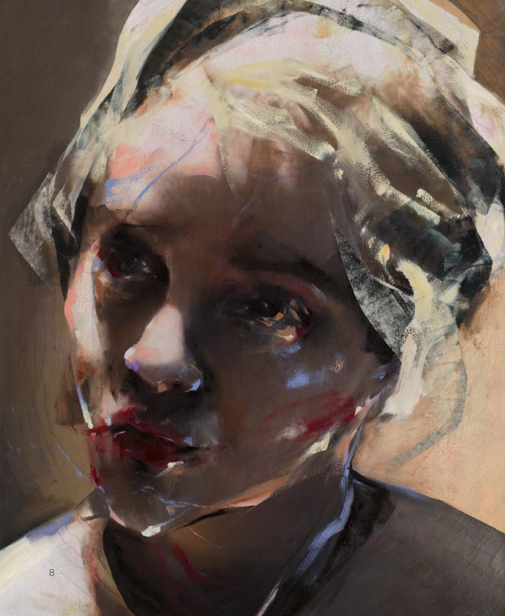
DULCINEA II, 2010 Mixed Media - 200 x 160 cm

WHAT IS IMPORTANT IS TO SEE BEYOND THE SKIN AND TAKE THE EYE FURTHER THAN THE LIMIT