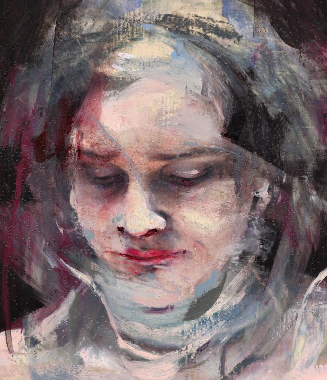
DULCINEA V, 2010 Mixed Media - 75 x 65 cm