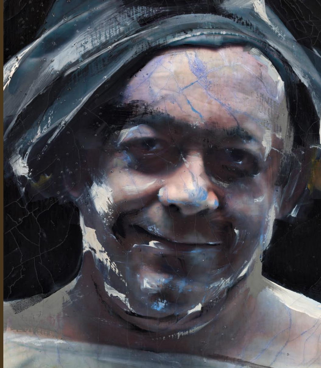
SANCHO PANZA IV, 2010 Mixed Media - 75 x 65 cm