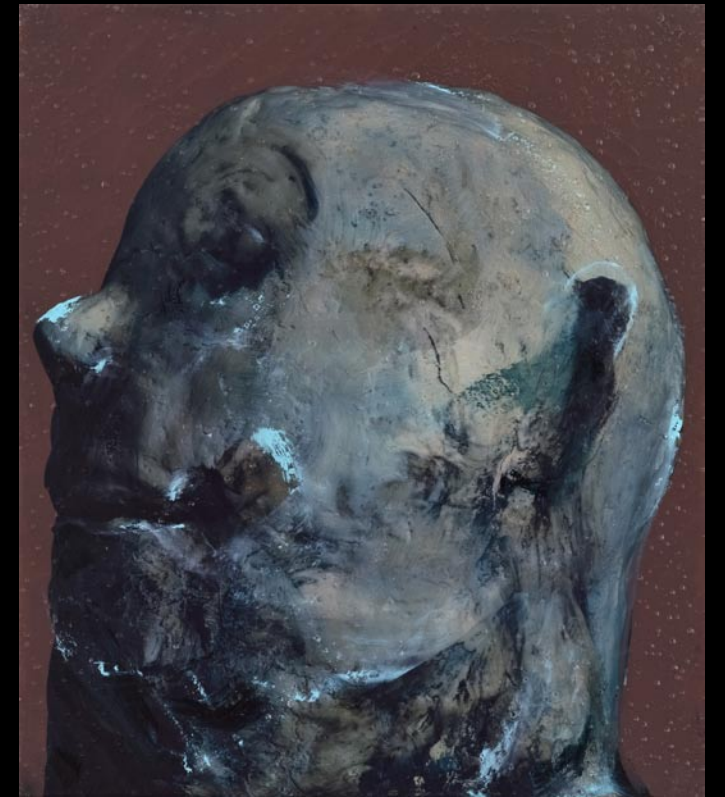
INSTALL-SHARON III, 2010 Mixed Media - 75 x 65 cm